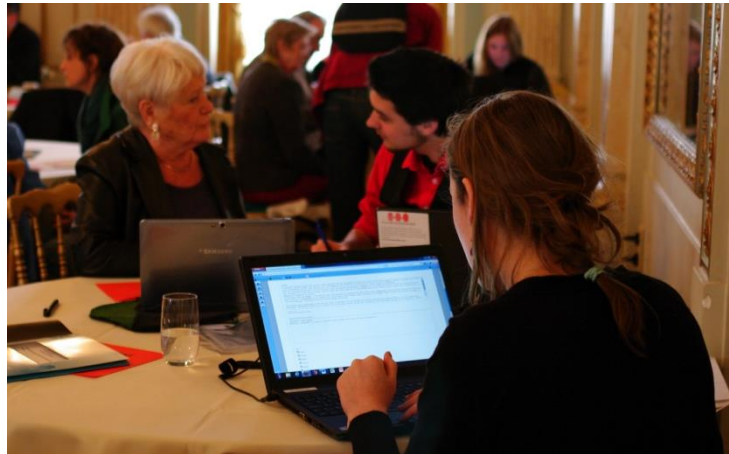
Figure 3 With two people working at one interview station, one can take notes while the other interacts with the contributor.

It's recommended that two people work at each interview station, one to perform the interview while the other writes down the story. This can save time and be more natural (the interviewer can focus on the visitor instead of the computer screen), and ensure no information is lost.