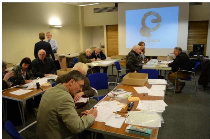
Figure 1. A digital collection day at Banbury Museum