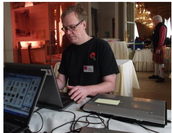
Figure 5 Scanning