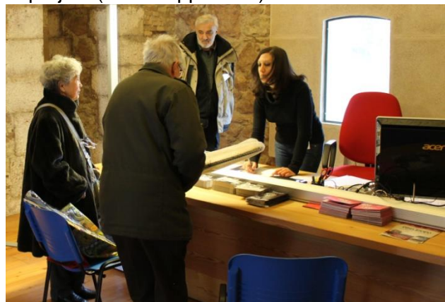
Figure 2 Receiving visitors at the Welcome Desk

At busy times, it may be necessary for people to wait for their interview. The Welcome Desk will help keep track of who is next and keep in touch with the staff managing the interview queue and the floor manager.